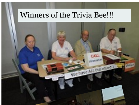
Winners of the Trivia Bee!!!

Trivia Bee was exciting! Our 2 teams and our cheerleaders were great!